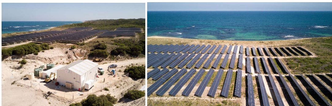
Garden Island Microgrid

The GIMG received the Approval to Operate from Western Power in late June 2019 and in late July received final sign-off from DoD and commenced operations.