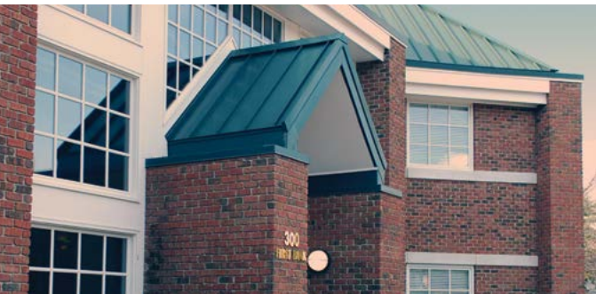
First Bank headquarters, Southern Pines, NC

Another source of strategic growth is acquisitions. In 2013, we completed the purchase of two competitor branches located in Southern Pines and Rockingham. We consolidated the Southern Pines branch into our existing nearby branch (without buying the competitor's building), whereas in Rockingham, the branch we purchased is now our flagship branch in that long-time First Bank market. While we assumed all deposits of the two branches, we hand-selected the loans we purchased. The purchase of the two branches was a low risk transaction that eliminated a competitor, while more efficiently leveraging our existing footprint.