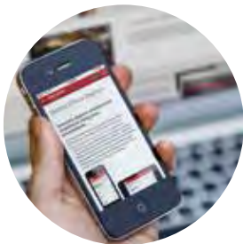
WE LAUNCHED A NEW DIGITAL BANKING PLATFORM INCLUDING MOBILE CHECK DEPOSIT FOR OUR CUSTOMERS

Total loans at December 31, 2014 amounted to $2.40 billion, a slight decrease from $2.46 billion a year earlier. While some of the decrease was expected as a result of declining loan balances assumed from two failed-bank acquisitions, the otherwise essentially flat growth was a disappointment. We believe this was a result of unusually strong competition driven by the current interest rate environment, several of our historically high growth markets that are recovering more slowly from the recession, and pressures from new internal loan processes implemented in 2014 designed to enhance loan quality. We believe these were temporary pressures, and we are optimistic that we will soon experience loan growth more consistent with our historic norms. Expansion efforts, which I discuss below, should also enhance future growth.