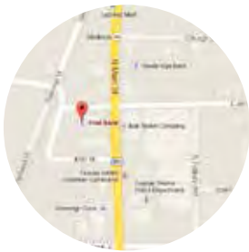
WE OPENED A NEW BRANCH IN FUQUAY-VARINA, OUR SECOND BRANCH IN WAKE COUNTY, NC