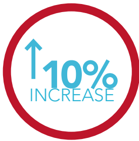
10% INCREASE IN CHECKING ACCOUNT BALANCES