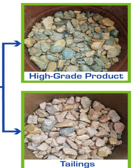
Image 4: ROM feed to the ore sorter before separating into product and tailings