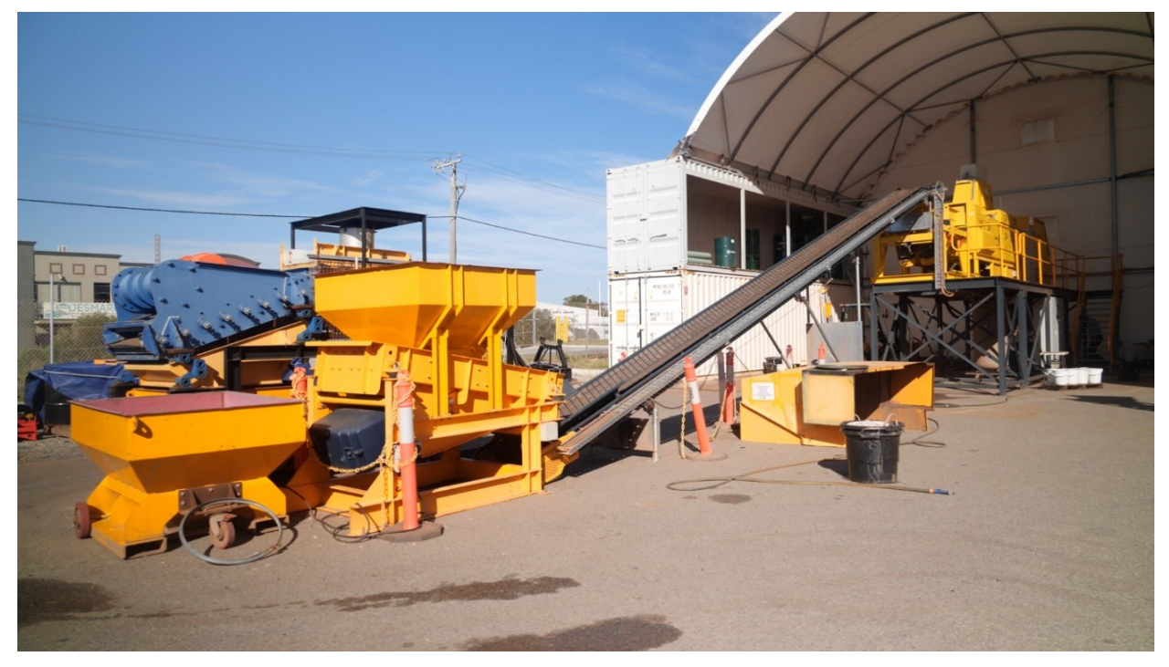
Image 3: Ore sorting facility used during testwork is the same size proposed for use at Kayelekera

Two samples of run of mine ore (~500kg) were sent to STEINERT's testing facility in Perth. STEINERT was selected in part due to the testing facility being a commercial scale ore sorting unit (Image 3) which is similar to the facility that may be installed at Kayelekera. The estimated capital cost for an ore sorting unit is US$2 million to US$3 million.