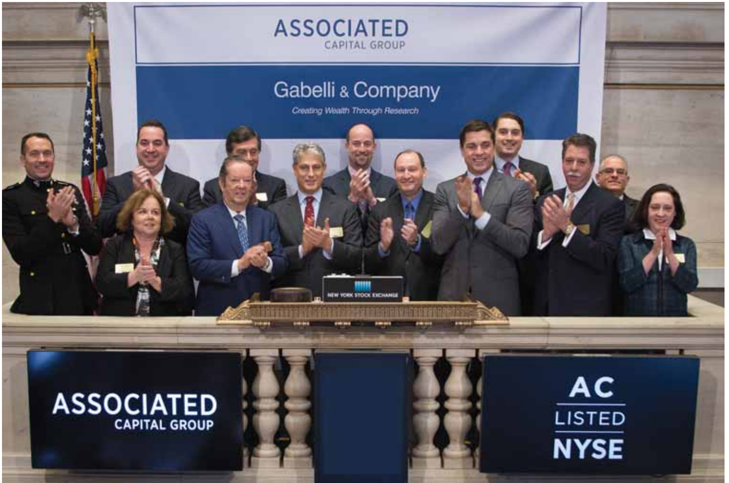
Our teammates ringing the bell on the New York Stock Exchange celebrating our listing