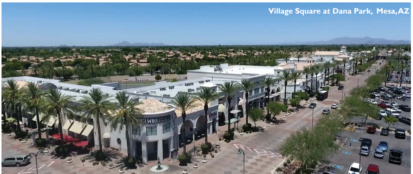
Village Square at Dana Park, Mesa, AZ

Although our returns have been impressive, we continue to believe that our current market valuation does not reflect the true value of our enterprise. We believe that our entrepreneurial culture and the well-synchronized execution of our unique business model will result in a market valuation, over time, more in line with the true value of the enterprise, providing a tremendous opportunity for our shareholders.