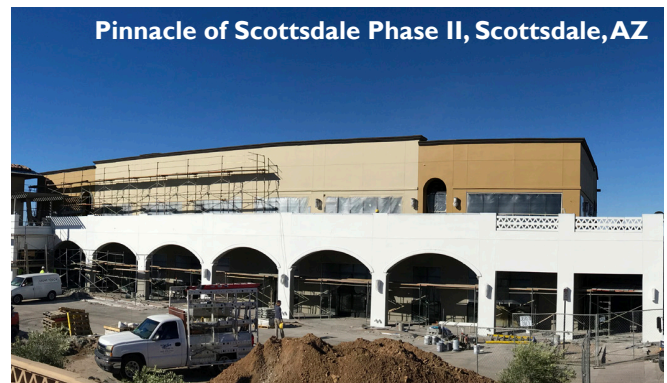
Pinnacle of Scottsdale Phase II, Scottsdale, AZ