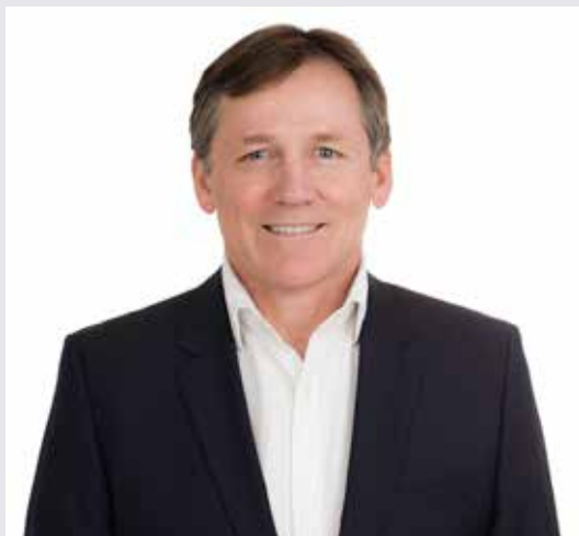
David Kirk Chairman and Executive Director

David has been chief executive of two ASX-listed companies, including diversified media company, Fairfax Media Limited, where he led a number of successful internet sector investments. David is currently Chairman of ASX-listed companies, Trade Me Group Limited and Kathmandu Holdings Limited. He is also a director of Forsyth Barr Limited, a privately owned investment firm, and a director each of SiteMinder, SMI and Viocorp. David was also previously Chairman of Hoyts Group.