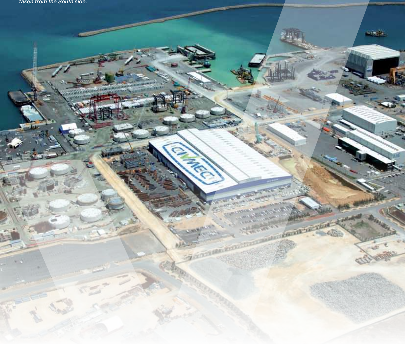
Photo: Aerial view of Cvmec facility taken from the South side.