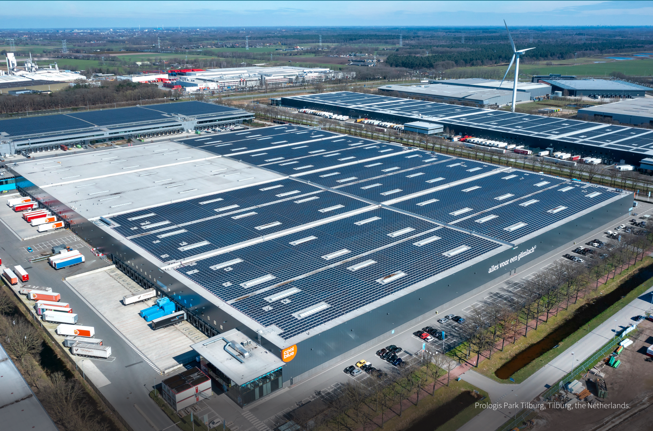
Prologis Park Tilburg, Tilburg, the Netherlands.