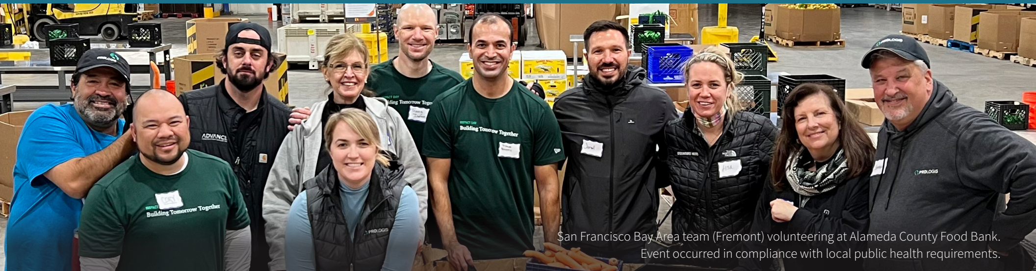
San Francisco Bay Area team (Fremont) volunteering at Alameda County Food Bank. Event occurred in compliance with local public health requirements.