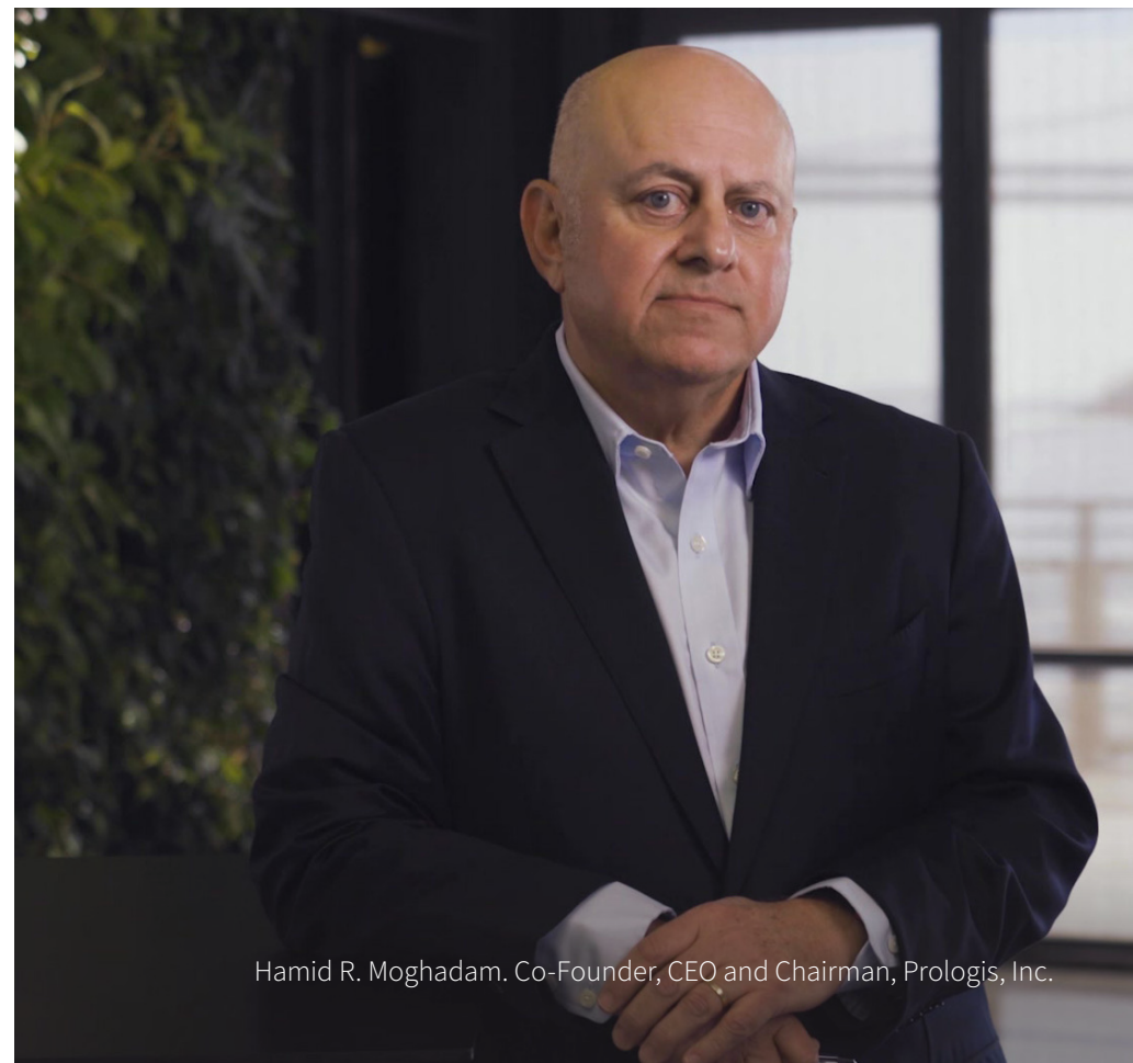
Hamid R. Moghadam, Co-Founder, CEO and Chairman, Prologis, Inc.

Through our Research arm using proprietary data, Prologis generates unique reports that give our customers, the financial community and the public real-time insights into our business and industry. In 2021, our research revealed how e-commerce continues to prompt an urgent need for more space as our customers adjust their short-term inventory strategies to ensure resiliency in the long term. Because we expect disruption in global supply chains to persist beyond 2022, we have anchored our future resilience on speed-to-market and flexibility. Above all, we continue to win because of our unique differentiators that underpin our continued growth and success.