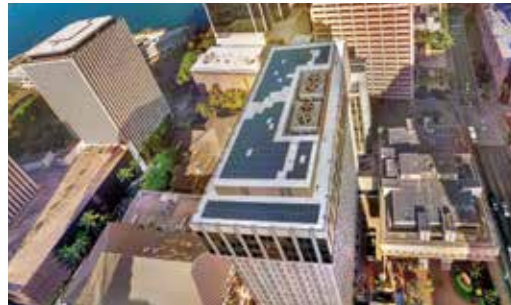
Bank of Hawaii's 104.4 kW photovoltaic installation atop its headquarters building is the largest PV installation in downtown Honolulu.

Our facilities—not just our branches, but also our back-office operations—play a role in our ability to perform well. We updated our facility maintenance strategy to provide energy savings while enhancing the customer and employee experience. Window tinting, efficient air conditioning units and controls, lighting upgrades and PV panels are all part of the plan to reduce energy costs. Utilities are currently the second highest occupancy expense, and substantial savings are expected from these initiatives in 2014.