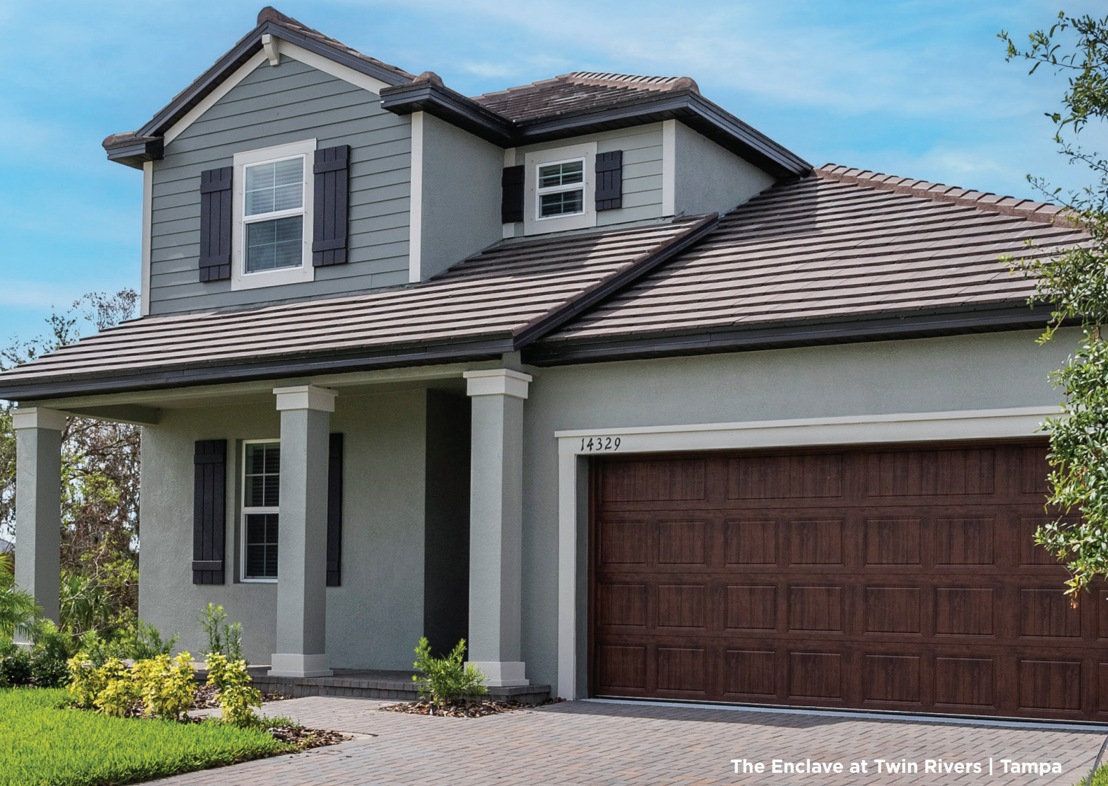
The Enclave at Twin Rivers | Tampa

Atlanta | Carolinas | Chicago | Dallas | Denver | Houston | Jacksonville | Las Vegas | Minneapolis Northern California | Orlando | Phoenix | South Florida | Southern California | Seattle | Tampa