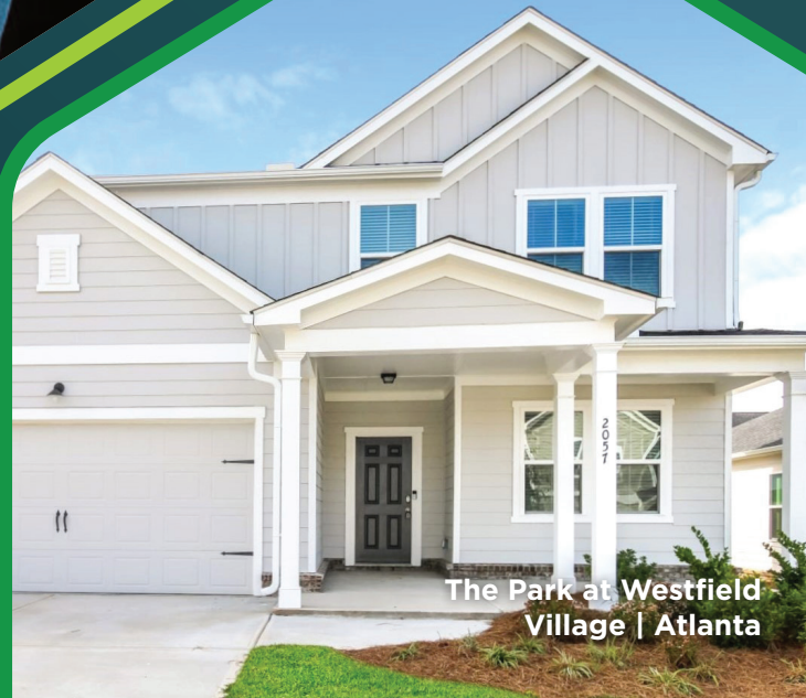
The Park at Westfield Village | Atlanta