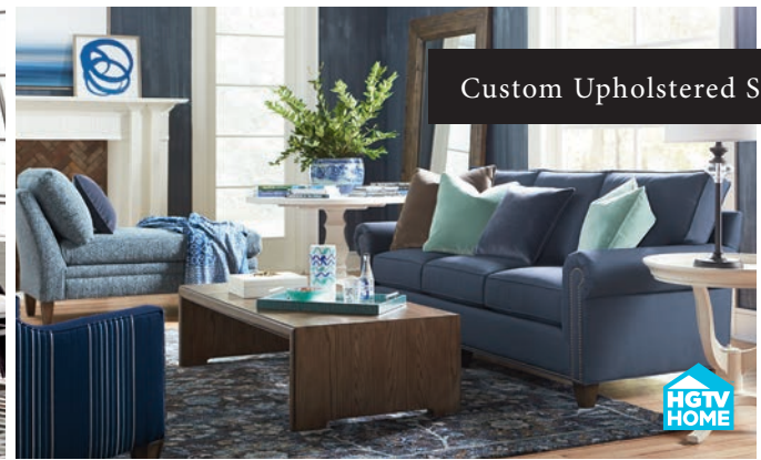
Custom Upholstered Sofa