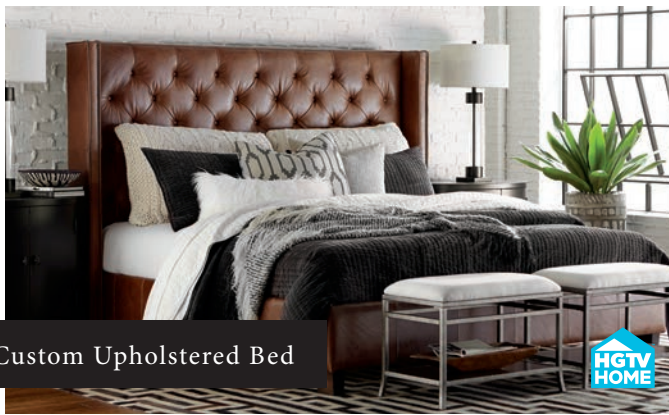
Custom Upholstered Bed