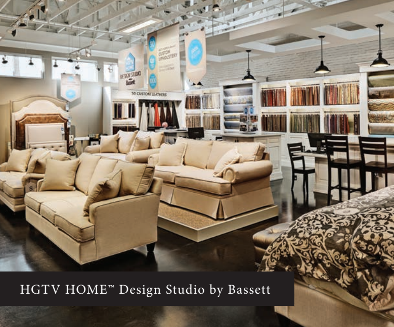
HGTV HOME™ Design Studio by Bassett