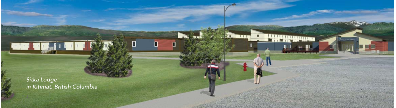
Sitka Lodge in Kitimat, British Columbia