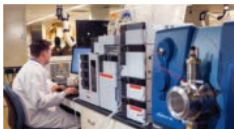
Achillion continues to make significant advancements in the research and development of a variety of compounds to address infectious diseases in its New Haven, Connecticut labs.

Achillion maintains in-house chemistry and virology expertise that has enabled the discovery and development of a robust portfolio of wholly-owned compounds designed for the treatment of HCV. A number of targets have been identified to treat HCV and Achillion is focusing the majority of its resources on advancing potentially best-in-class inhibitors of the NS3/4A protease and NS5A protein of the hepatitis C virus. Achillion's research has led to the advancement of: sovalprevir, a once-daily, second-generation protease inhibitor currently in Phase 2 development; ACH-3102, a highly potent, once-daily NS5A inhibitor that was designed to have an improved barrier to resistance, also in Phase 2; and ACH-2684, a highly potent, once-daily protease inhibitor that has completed Phase 1 clinical studies with demonstrated equivalent activity in patients both with and without compensated cirrhosis.