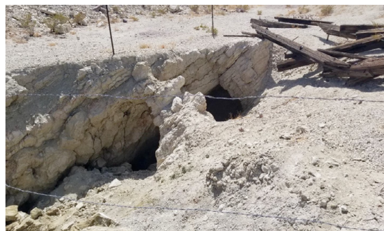
Figures 4 & 5: Argos Trench, looking west and historical celestite workings (Source Gregg Wilkerson, April 2021) 5