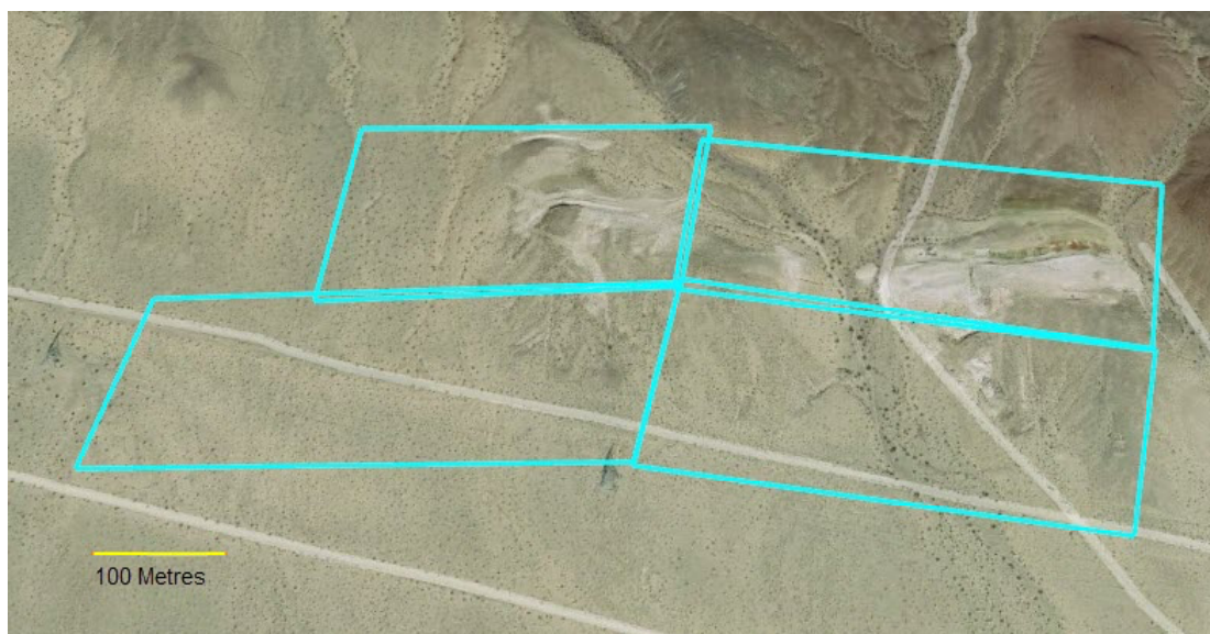
Figure 1: Google Earth view showing the four patented mining claims that make up the Argos Strontium Project

At present there is no operating strontium mine or strontium carbonate production facility in the USA 1,2 . The Argos deposit is comprised of four patented mining claims that cover 75 acres and is considered to be the largest strontium deposit in the USA 5 .