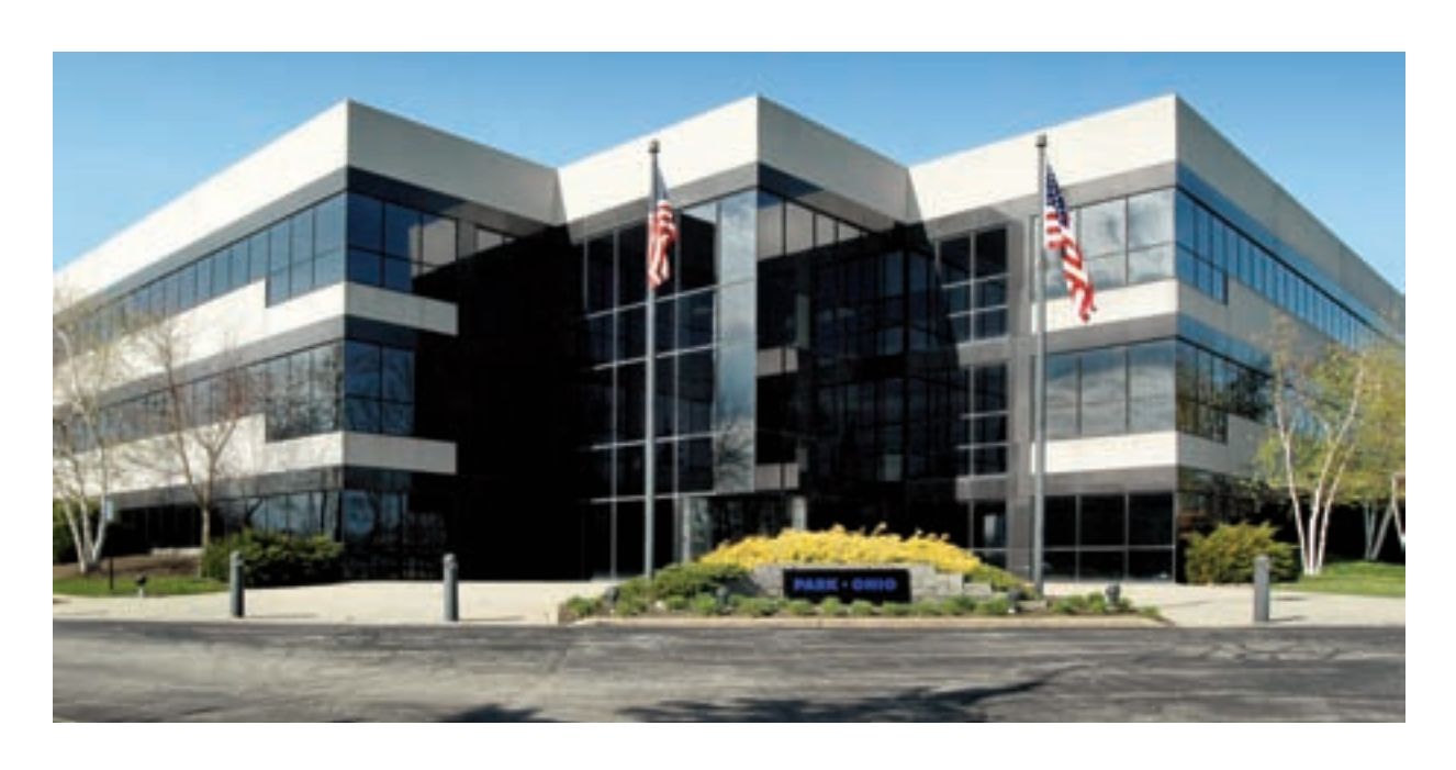
Park-Ohio World Headquarters

Please send your suggestions or recommendations to investor@pkoh.com or mail them to us at our headquarters.