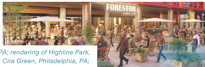
Starting from top left: Drexel Square at Schuylkill Yards, Philadelphia, PA; rendering of Highline Park, Schuylkill Yards, Philadelphia, PA; rendering of Broadmoor, Austin, TX; Cira Green, Philadelphia, PA; renderings of 25M office interior in Washington, D.C.; rendering of Bulletin Building at Schuylkill Yards, Philadelphia, PA.