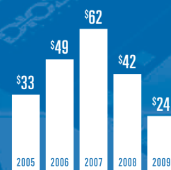
NET INCOME NON-GAAP ADJUSTED 1 in millions