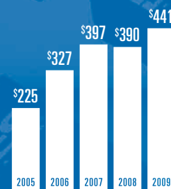
STOCKHOLDERS' EQUITY in millions