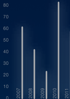
NET INCOME [NON-GAAP ADJUSTED] 1 in millions