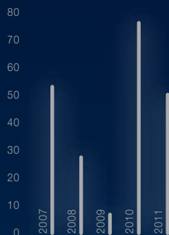
NET INCOME in millions