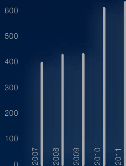
NET SALES in millions