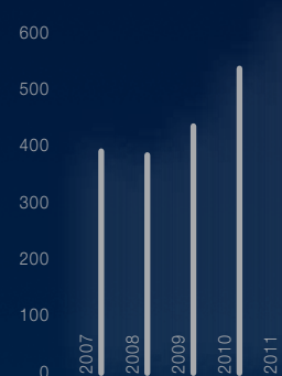
STOCKHOLDERS' EQUITY in millions