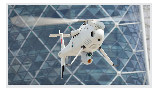
L-3 provides an extensive portfolio of ISR imaging and targeting systems, with turrets mounted to thousands of systems worldwide, on over 100 different platforms, including all classes of UASs.

Given our large population of former military employees, veterans' issues are a natural area of focus for L-3. We are most actively involved at the national level in the Wounded Warrior Project, Marine Corps Scholarship Foundation, Homes for Our Troops and Hope For The Warriors®, which provide much needed help and support for soldiers and their families who have served our country honorably. We also support many