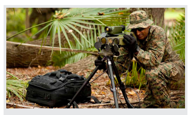
L-3's new Scarab system is a modular laser designator equipped with rangefinding and an IR thermal imager, providing accurate target designation, both day and night, and in nearly all battlefield conditions.

supply logistics and networking capabilities for specialized video teleconferencing, Voice over Internet Protocol (VoIP), and full-motion video and chat to connect senior leaders in flight. We also continued to provide important enabling technologies to a number of UAS programs throughout 2013, including Global Hawk, Predator and Gray Eagle, and our legacy ROVER products, which are used both domestically and internationally.