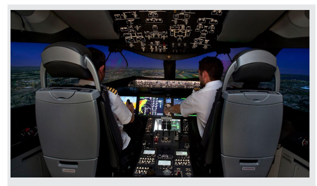
L-3's 787 full flight simulator is the first in the world to be qualified with a fully functional avionics capability, including an electronic flight bag and heads-up display.

L-3's core competencies are well-aligned with customer needs and priorities in the current cycle of tight budgets and ongoing uncertainty. More than ever, we are collaborating across business segments and managing our cost structure to develop the most effective, low-cost solutions for our customers.