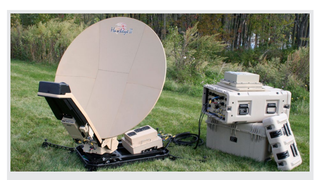
L-3's Hawkeye<sup>™</sup> III Lite VSAT enables high data rate communications, such as Internet/VPN, live video conferencing, surveillance or reconnaissance, in areas where satellite resources are limited.

Our strategic emphasis on building relationships and market share in international and commercial business is producing results. We have been steadily increasing our focus on introducing discriminating technologies for international sales and developing differentiated solutions for commercial customers. As a result, we have seen double-digit growth in our international and commercial