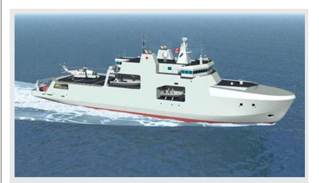
With maritime technology in use by 20 navies worldwide, L-3 was selected to support the design for the next generation of innovative IPMS and integrated interior/exterior communications systems for the Royal Canadian Navy's new class of AOPS ships.

The U.S. Navy's new hovercraft, the Ship-to-Shore Connector (SSC) program, will also be supported by L-3 as a member of Team Textron. L-3 is currently designing, building, integrating, testing and delivering an SSC C4N;