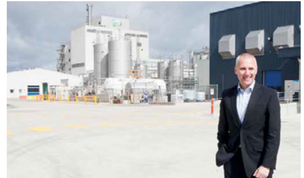
NEW PLANTS Our Stanhope site in Australia reopened and Edgcombe in New Zealand was expanded.

For non-reference products, gross margins were $811 million, $160 million down on last year. This was primarily due to significantly lower stream returns. Stream returns are the relative difference between reference product and non-reference product prices. This relative gap narrowed significantly, reflected in the 30 per cent increase in revenue per metric tonne for reference products versus a 12 per cent increase for non-reference products. This resulted in negative