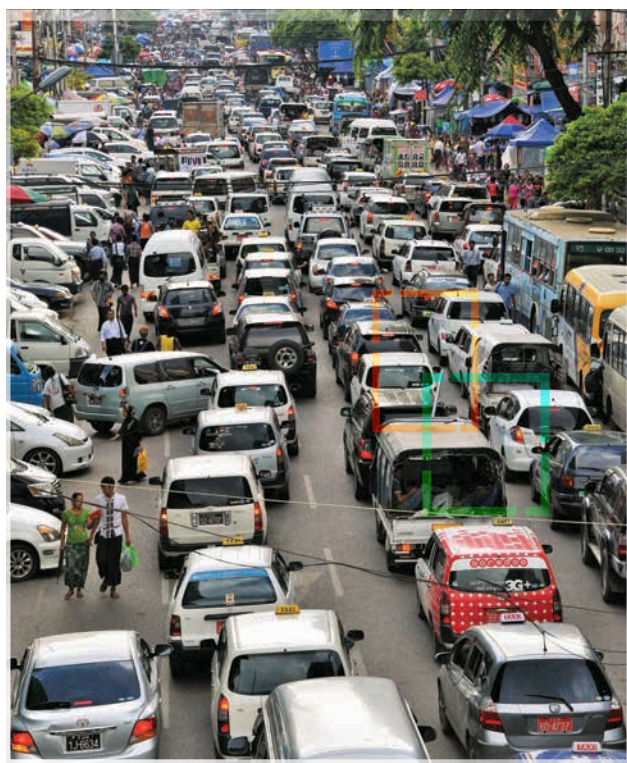
Like the other Asian Tigers before it, Myanmar now experiences acute traffic congestion

No additional sums were paid in the year to Directors for work on behalf of the Company outside their normal duties.