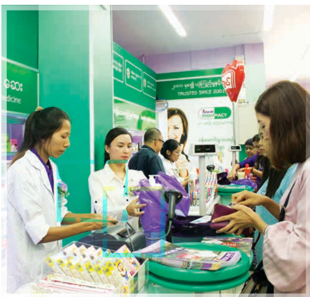
Medicare provides a “Good Pharmacy Practice” at all its stores