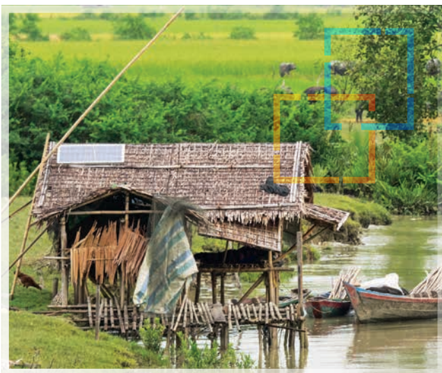
Solar panels are an increasingly frequent sight even in the countryside

From a fund raising perspective, we are encouraged by the two recent rounds of fund raising and this has affirmed our strategy of raising funds only in line with the growth in our business needs. We continue to assess the possibility of a secondary listing in Asia to enhance liquidity in our shares and also to make our shares more accessible to Asian investors. We will make further announcements on this as we develop this further.