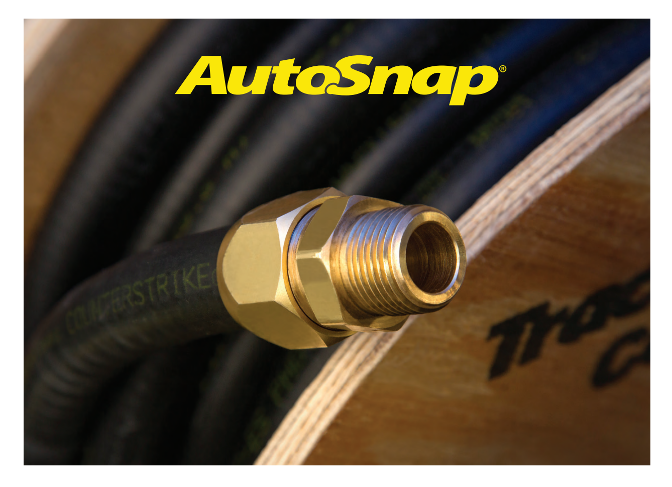
Progress Through Innovation