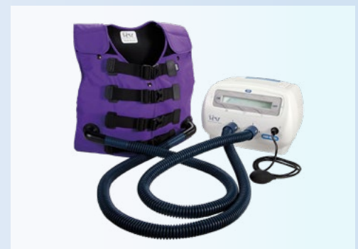
THE VISIVEST™ AIRWAY CLEARANCE SYSTEM