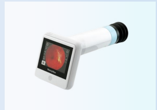
WELCH ALLYN® RETINAVUE™ 100 IMAGER