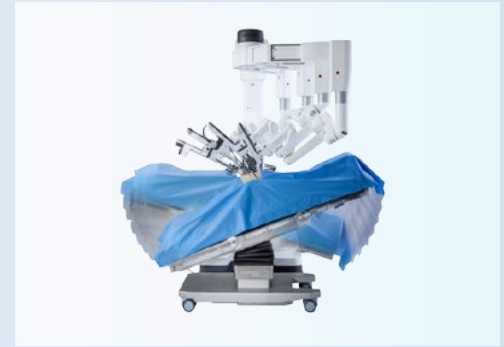
TRUMPF MEDICAL™ TRUSYSTEM™ 7000DV OPERATING TABLE