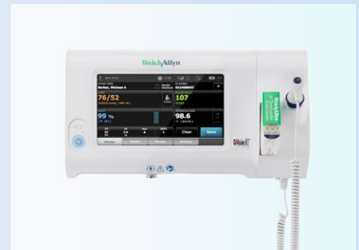
WELCH ALLYN® CONNEX® SPOT MONITOR