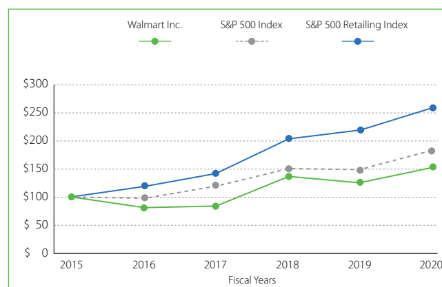
Comparison of 5-Year Cumulative Total Return* Among Walmart Inc., the S&P 500 Index, and S&P 500 Retailing Index

*Assumes $100 Invested on February 1, 2015 Assumes Dividends Reinvested Fiscal Year Ending January 31, 2020