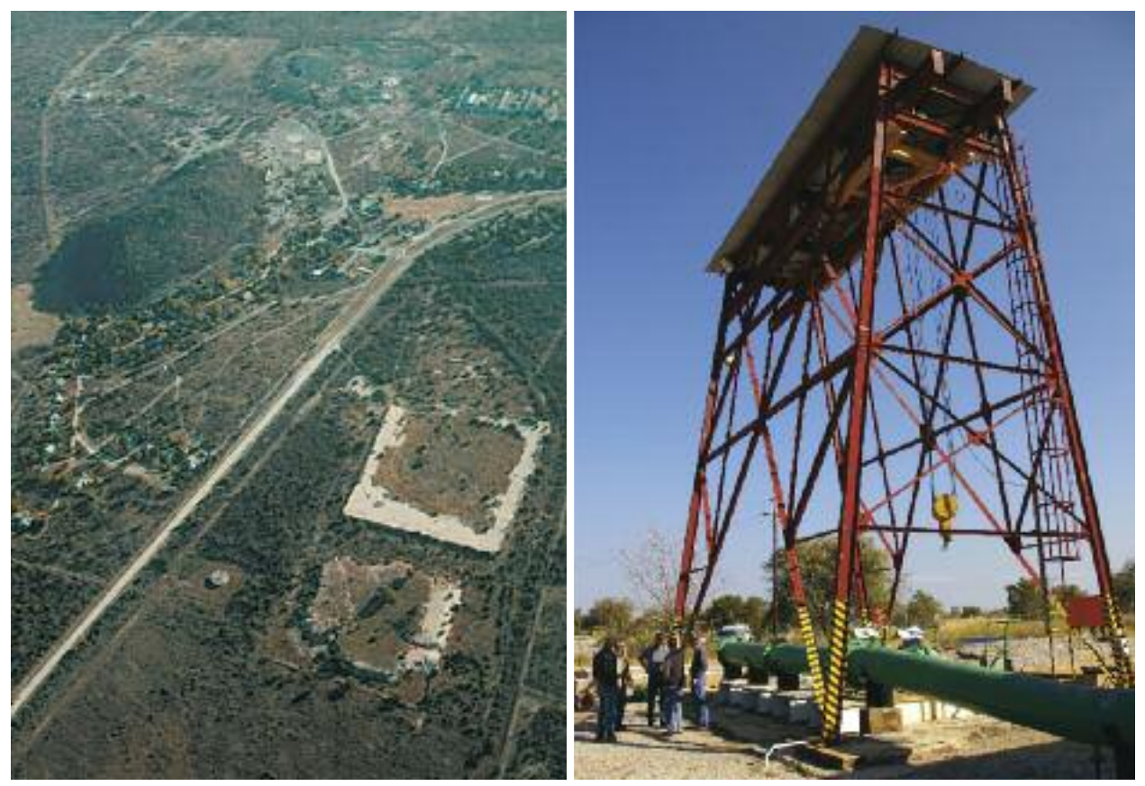
Aerial view of the Berg Aukas mine.