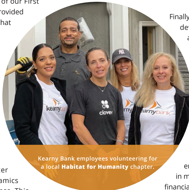
Kearny Bank employees volunteering for a local Habitat for Humanity chapter.

climate change. To better quantify these risks, we conduct an annual climate risk analysis. The analysis reviews the various risks posed to our retail branch network, regional corporate headquarters and loan portfolio as measured by the Federal Emergency Management Agency National Risk Index. Overall, our business continues to be exposed to only low to moderate risk of natural disaster. During 2023, we implemented an energy management system to monitor and reduce energy usage in our regional corporate headquarters. Transitioning to paperless processes utilizing digital technology is another way to help reduce our overall reliance on paper resources. Lastly, the move to more cloud-based technologies to reduce on-premises power consumption by our electronic equipment should continue to evolve over the coming years.