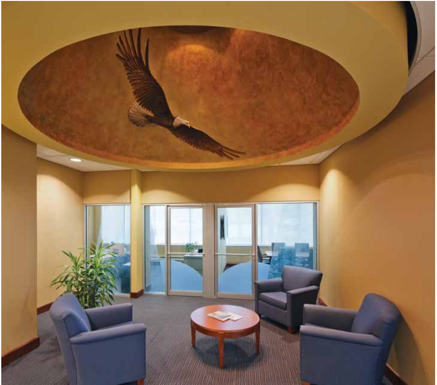
EagleBank Park Potomac Branch, Potomac, Maryland. The branch lobby features a ceiling eagle mural by ATS Studios. With our seven Montgomery County branches and our Bethesda, Maryland headquarters, EagleBank's Maryland connections get stronger every day.