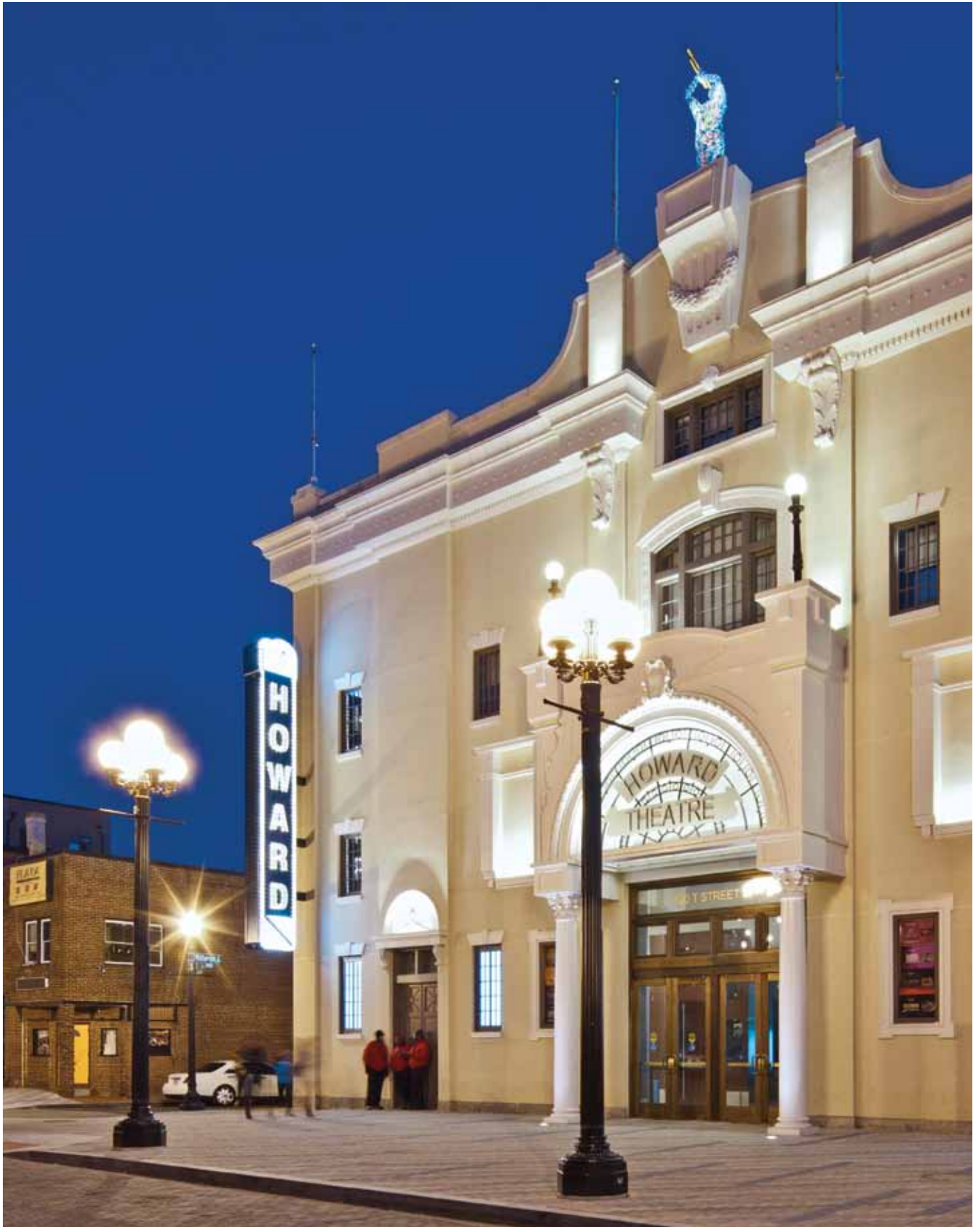
EagleBank client Howard Theatre, Washington, DC. EagleBank helped provide the funding for the restoration of this historic theater in the District's Shaw neighborhood. From Downtown to Georgetown, from Nationals Park to the Potomac River, EagleBank is honored to be a part of Washington, DC's revitalization.