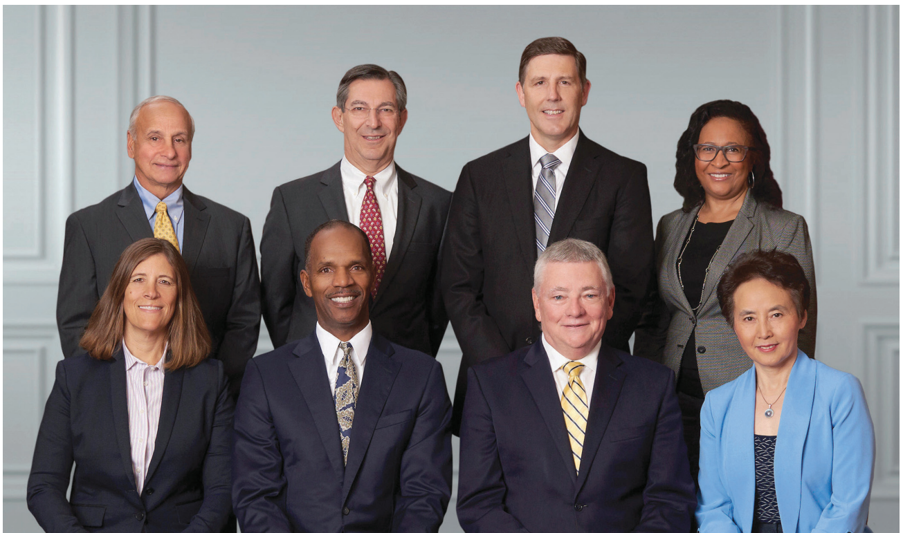
Board of Directors (2)

The pandemic forced us to use new tools to remain visible and communicate with our employees, and I plan to get back to in-person visits at our locations across the world. I strongly believe in the importance of making those personal connections and providing our people the chance to give their feedback directly. Despite the ongoing uncertainties related to the pandemic, our employees once again demonstrated that Koppers team members are some of the most generous and supportive people anywhere, as they led and participated in scores of fundraising activities and community events in 2021.