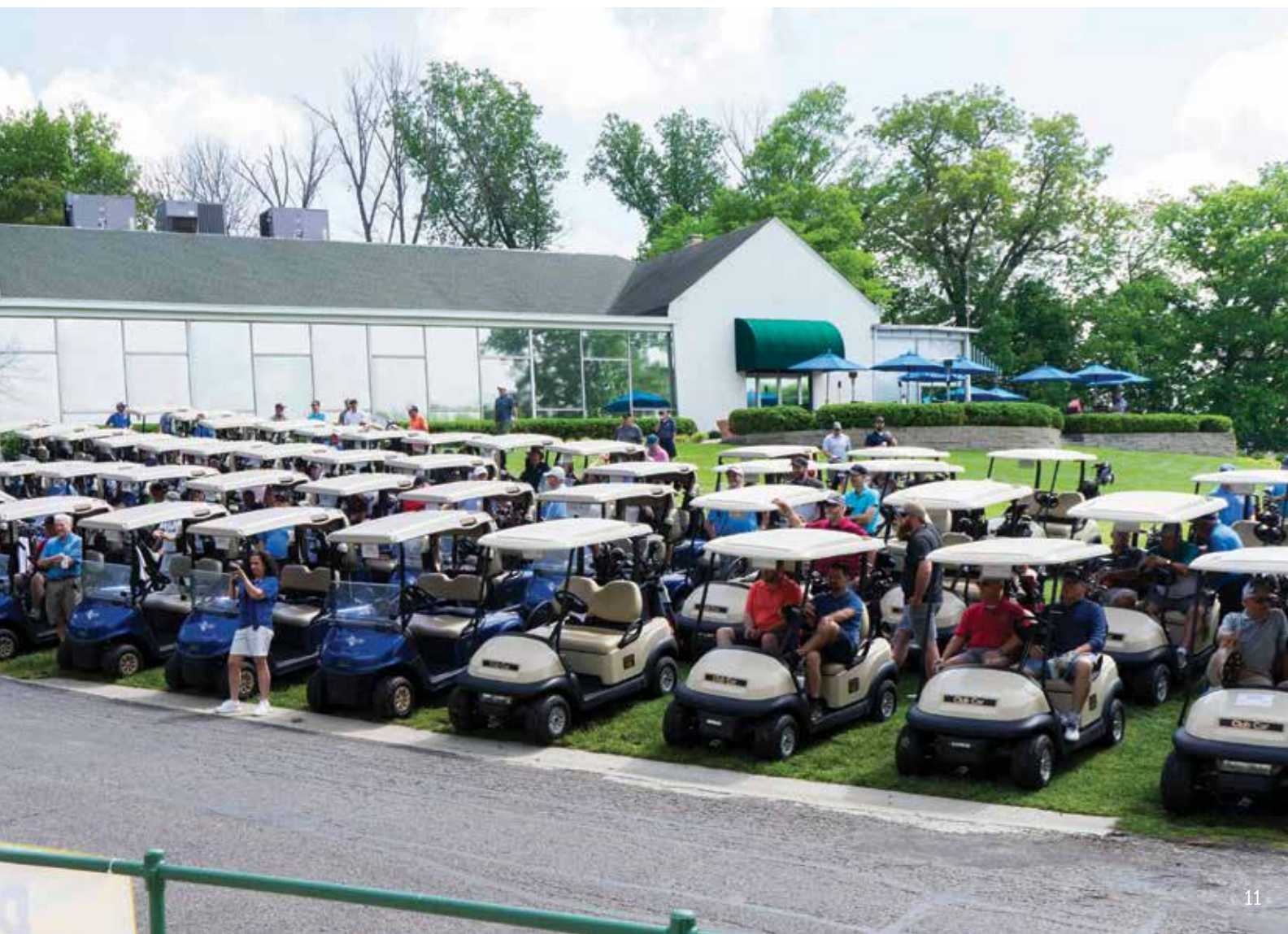
Below: Teams prepare to start their round at the 2022 Gibault Children's Services Golf Scramble.

Since 1921, Gibault's residential and community based programs have served over 10,000 at-risk youth and their families. First has been a longtime supporter of Gibault's mission and believes in their effort to effect positive change and development of the young people entrusted in their care.