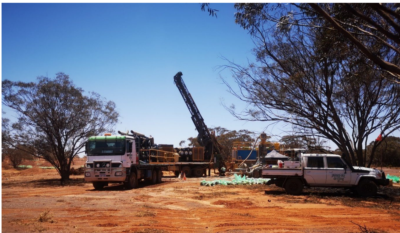
Figure 2: RC rig drilling Resource extensional holes at the Fingals Mining Centre (January 2022)