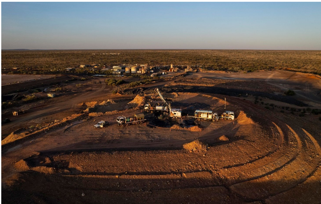
Figure 4: Diamond drilling the Kavanagh deposit at the Coyote Gold Operation