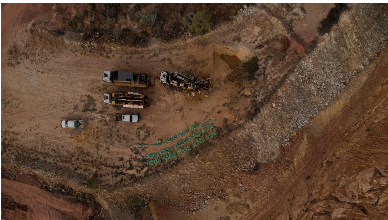
Figure 3: RC Rig drilling at Coyote Central targeting shallow Resources around the potential Speedy open pit.