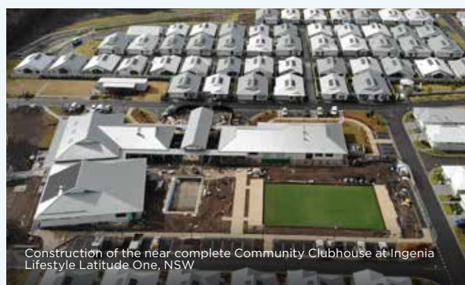
Construction of the near complete Community Clubhouse at Ingenia Lifestyle Latitude One, NSW

The 223 deposits and contracts already in place at 30 June 2019, combined with the ability to leverage the Group's scale and generate fees through delivery of development projects for the Joint Venture and managed funds, is expected to support an increased contribution from development in FY20.