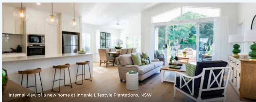
Internal view of a new home at Ingenia Lifestyle Plantations, NSW

The core of this portfolio is rental revenue generated from residents who generally fund their rental payments via government pension and rental assistance. Ingenia is growing this business through acquisition and the development of new homes.