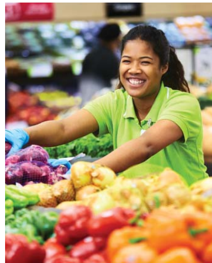
We will build on the success of our discount model by expanding the FreshCo banner in Western Canada.

Our world-class e-commerce offering will redefine convenience for grocery customers.