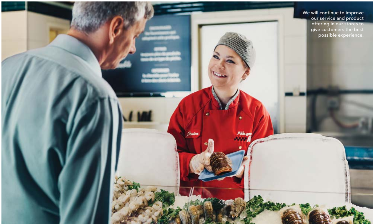
We will continue to improve our service and product offering in our stores to give customers the best possible experience.

Launch home delivery through Ocado partnership