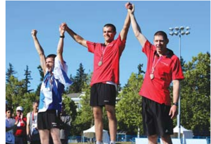
Sobeys is proud to co-present the Special Olympics Canada 2018 Summer Games in Antigonish, Nova Scotia.

Empowering Special Olympics athletes to live healthier lives has been a mission for Sobeys from the earliest days of our national partnership. To that end, Sobeys and Special Olympics teamed up to create a truly innovative nutrition program, developed specifically to address the unique health risks experienced by many individuals with intellectual disabilities. Our Better Food Nutrition Sessions are hands-on, fun and interactive workshops for Special Olympians, led by more than 100 Sobeys employee volunteers across the country. With a focus on quick and easy recipes and nutrition education, our goal is to reach over 20,000 athletes, caregivers and coaches by the end of 2019.