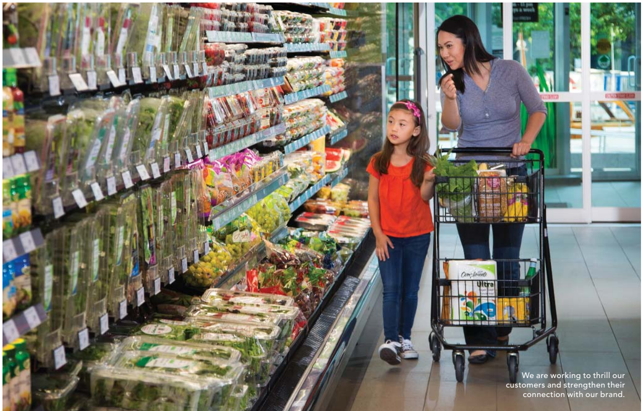
We are working to thrill our customers and strengthen their connection with our brand.

We are committed to providing a great customer experience and carrying the items that customers want most.