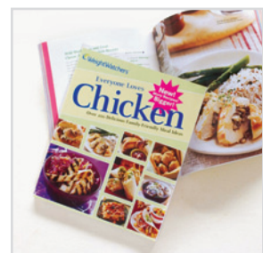
“Everyone Loves Chicken” cookbook, sold exclusively by Weight Watchers