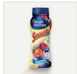
One of the many products available through retail outlets