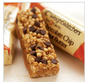
Just2POINTS! ™ Chocolate Chip & Peanut Butter Bars, sold exclusively by Weight Watchers