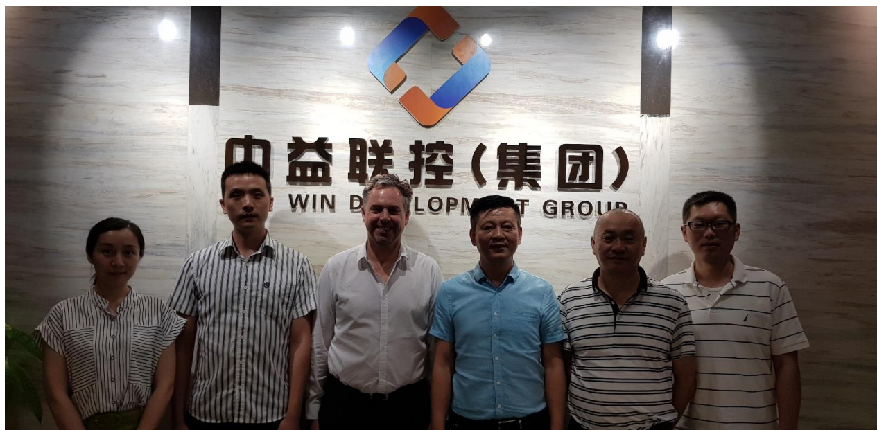
Figure 2 Win-Win Management team with AVL at Win-Win Development Group Head Office in Chengdu

The Company announced in June 2018 that it had signed a Memorandum of Understanding (MOU) with Chengdu based, Chinese steel and alloy product company Win-Win Development Group. The agreement provides an understanding between the two companies to further discussions around project finance and purchase of vanadium for steel strengthening. Win-Win is currently building a 5,000 tonnes per annum (tpa) vanadium carbon nitride (VCN) production line which requires approximately 7,000-8,000tpa of 98% V_2O_5 . The first stage will require 2,000-3,000tpa and be operational in 2019 and the second stage is planned for the following year. Win-Win has a shareholding in an operating production line currently producing 2,400tpa of VCN products for existing steel companies.